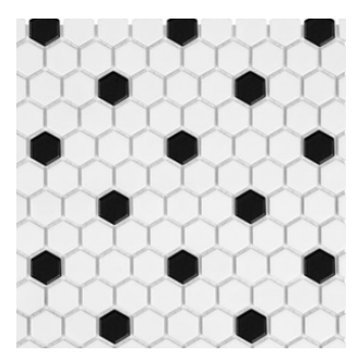
WHITE AND BLACK HEX CODE: KL1005D V1 Ⅲ