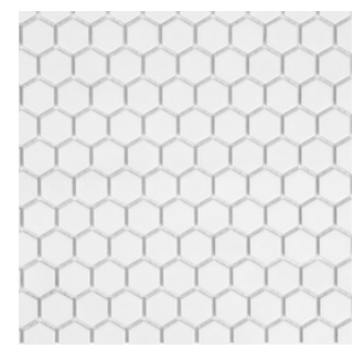
WHITE HEXAGON CODE: KL1005 V1 Ⅲ