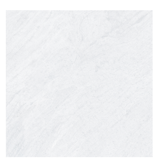
ORIGINAL CODE: AEAS (12×24)/ AEAI (24×24)