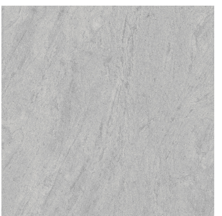
ANCIENT CODE: AEAU (12×24)/ AEAK (24×24) V2 Ⅲ