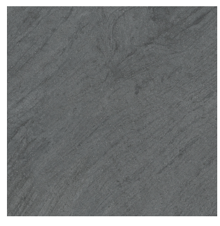
TEPHRA CODE: AEAV (12×24)/ AEAL (24×24) V2 Ⅲ